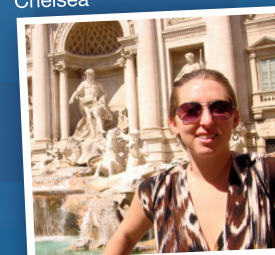
Ciao from Rome