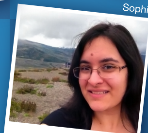
Mt. St. Helens